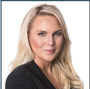
TARA MOSS PRO BONO COUNSEL