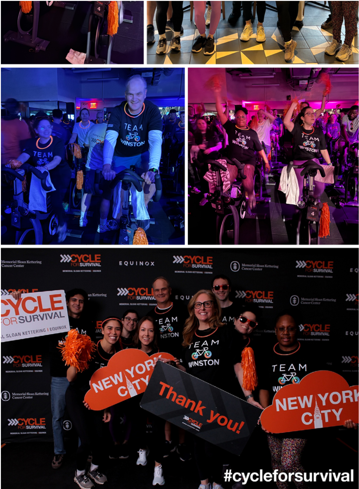
SAN FRANCISCO/SILICON VALLEY