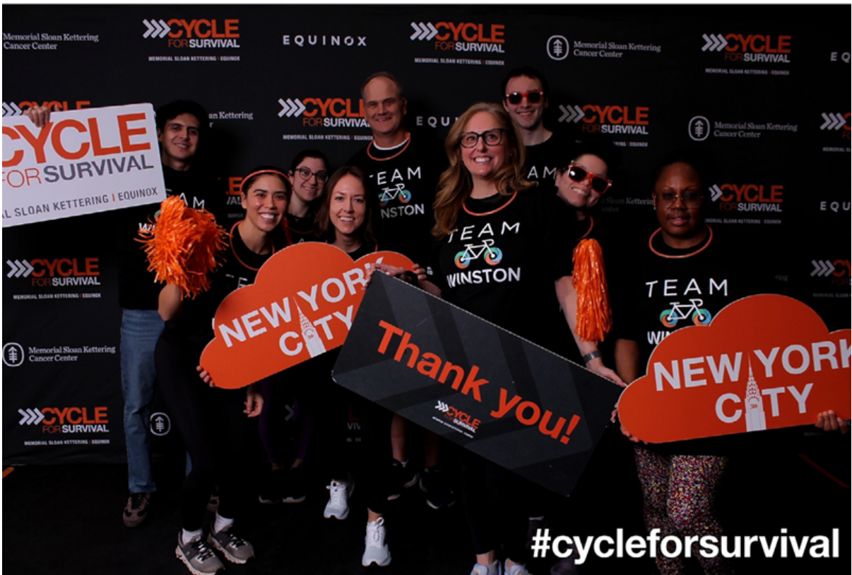
SAN FRANCISCO/SILICON VALLEY